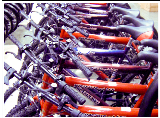
Figure 2. Carlos III

The Galerías del Paseo, the third facility, was built in the mid-1990s in tandem with the revitalization of two hotels at Paseo and Malecón. One hotel is the 1957–built Hotel Riviera, whose adjacent facility, Meliá Cohiba, was built some four decades later. The Galerías del Paseo is a dark-glass wrapped three story mall which, like Carlos III, houses about two dozen stores along a spiral concrete walk way that gives access to a super market, pet food and supply store, hardware store (on the ground floor whereas at Harris Brothers it is on the top floor), electronics goods, and a variety of general and specialty clothing and gift stores (Figure 3). Its striking façade prompted urban designers and architects to nickname it the “bat mall” because two small turrets rise up like “ears” on what appears to be the dark mask of batman (Scarpaci et al. 2002). It taps into retailers in the once bourgeoisie community of Vedado. Formerly owned by Cubalse, TRD now manages this Vedado shopping mall with 21 establishments.