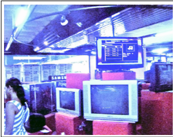
Figure 4. Comodoro shopping center