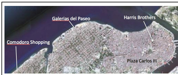
Figure 1. Location of Four Shopping Centers

The shopping centers and their management vary considerably. The oldest and most difficult to navigate is Harris Brothers, at the edge of the Habana Vieja, next to the iconic Bacardí building, and just a block from both Parque Central, Prado boulevard, and the pedestrian promenade Obispo. It dates back to a retail store established by American entrepreneurs in the early 20 th century. The City Historian's commercial division, Habaguanex, took it over and revamped it for retailing in the 1990s.